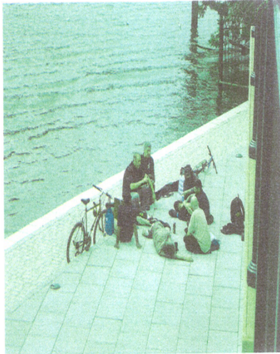
Group of Windsor drunks frequently drinking & sleeping all day on the private forecourt adjacent to FP51. They also urinate against the side of the townhouses of Eton Thameside in full view of the public. This was happening 3 to 4 times every week during the summer, and also well into the evenings. Many calls have been logged to local Police about this group who are also very intimidating and abusive when confronted. We have also had many examples of people in this area smoking 'pot' during the evenings, and sheltering under the balconies of the 4 townhouses in bad weather so they can continue drinking/smoking.